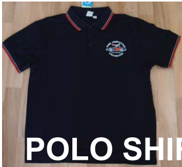
POLO SHIRTS - $40