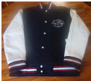
LEATHER SLEEVE JACKETS - $450