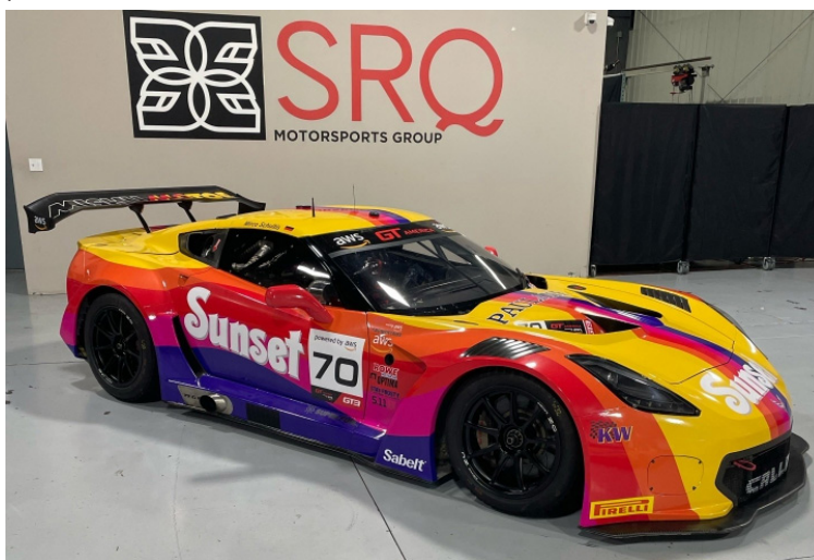
Callaway Corvette C7 GT3-R to Return to GT America Series in 2025