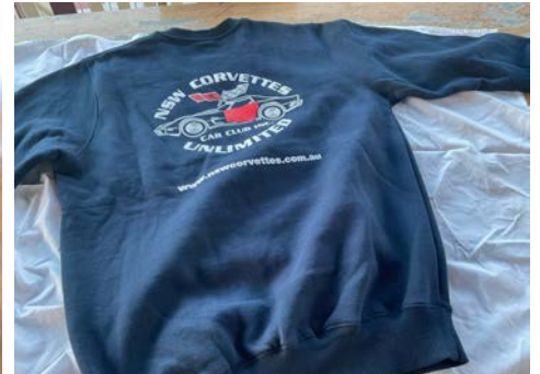
SWEAT SHIRTS - $50